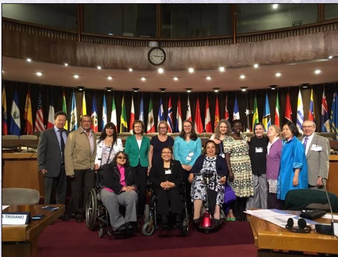
Photo: Expert Group Meeting Women with Disabilities - Development & Society Santiago de Chile in November 2016. The Division for Social Policy and Development (DSPD) of DESA co-organized with the United Nations Economic Commission for Latin America and the Caribbean (UNECLAC) in Santiago de Chile.